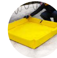
Mini Foam Wall