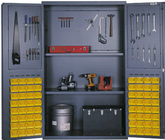
Bin & Tool