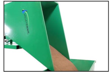
Step 3: Operate powered hopper using convenient forklift controls.