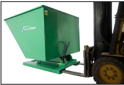
Step 1: Insert forks into fork pockets & secure unit using included safety chain.