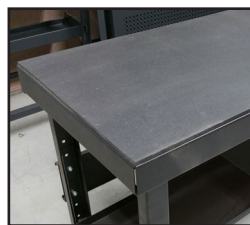
Rubber Mat Top