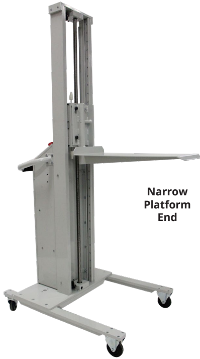
Narrow Platform End