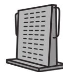
A-Frame Configuration Standard