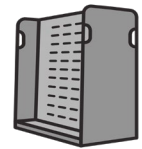
H-Frame Configuration Two end panels